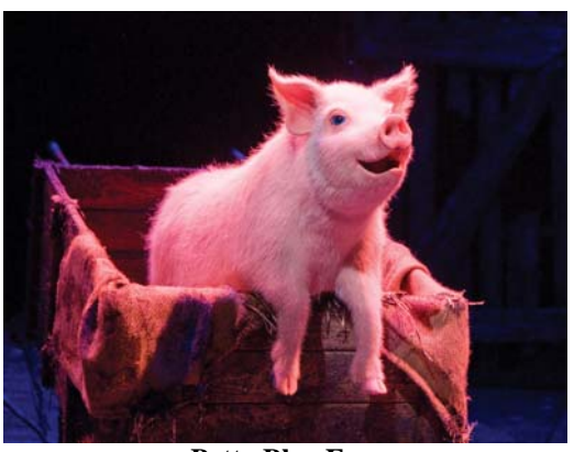
Betty Blue Eyes

lovely film A Private Function is set in Yorkshire and deals with a pig being illegally reared by toffs for a wedding banquet in 1947. Keeping to Alan Bennett's satire, the show covers smalltown snobbery, the difficulties feeding a family on post war rations and the greed of local bigwigs for status and gratitude. It is very well performed, particularly by Reece Shearsmith and Sarah Lancashire as the chiropodist and his wife, who steal Betty, the pig (a fantastic animatronic creation complete with fluttering eyelashes) when they are denied an invitation to the banquet. Adrian Scarborough is very funny as the meat inspector who prowls around like Inspector Clouseau. While this is no Billy Elliot, the music is tuneful and the choreography inventive.